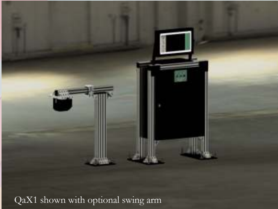
QaX1 shown with optional swing arm